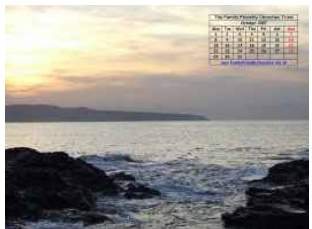
Looking across St Ives Bay from Godrevy.

You can download this picture from the web site as wallpaper for your PC.