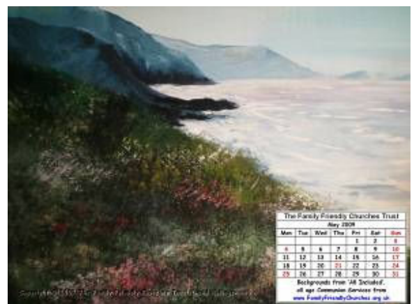
One of May's background images from All Included .

http://www.familyfriendlychurches.org.uk/offer.htm